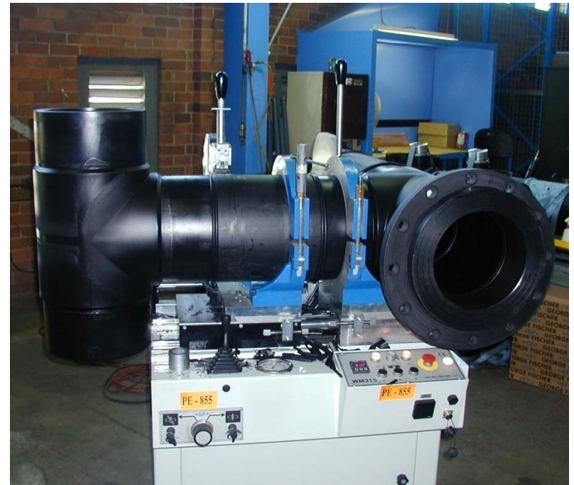
Example of Polyethylene Welding of Lengths and Fittings